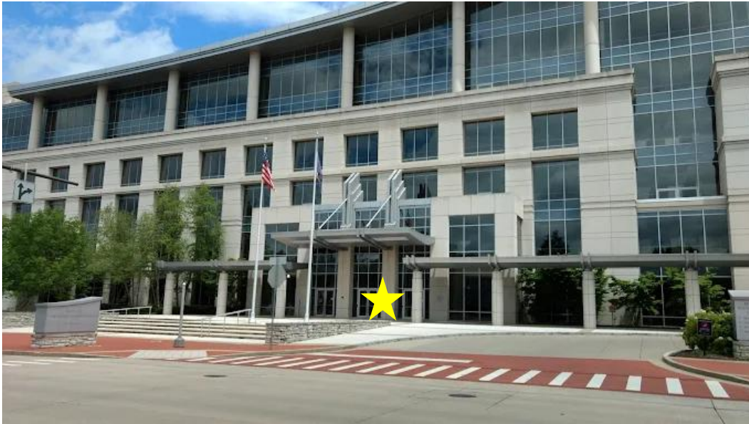
Kentucky Transportation Cabinet Conference Center, 1 st Floor - Auditorium (C105)